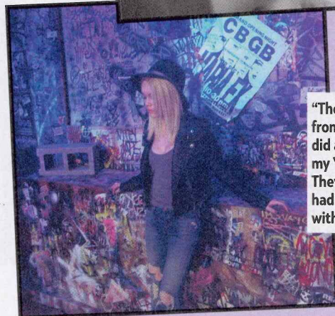
“They put up the walls from CBGB when we did a video shoot for my YouTube channel. They were so rad, so I had to take a picture with them.”