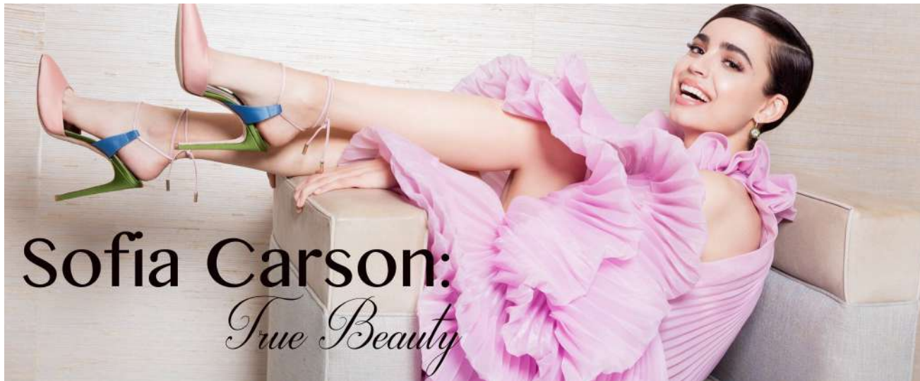
Sofia Carson: True Beauty